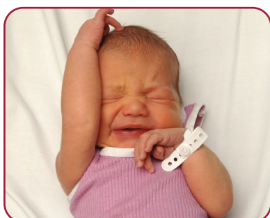
Agitated body movements