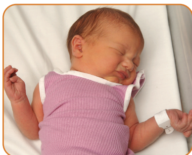
Increasing physical movement