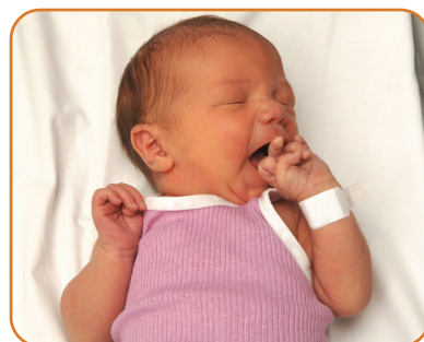
Hand to mouth