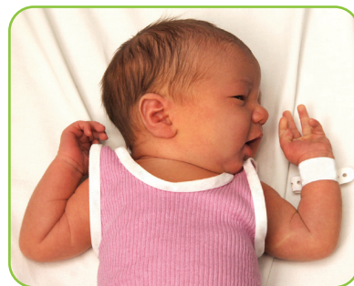
Turning head Seeking/rooting